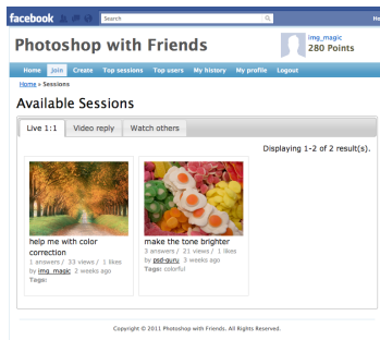
Figure 1: Photoshop with Friends is a Facebook application for Photoshop users where learners can exchange just-in-time help.

Juho Kim MIT CSAIL Cambridge, MA 02139 juhokim@mit.edu